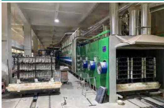
High quality standard